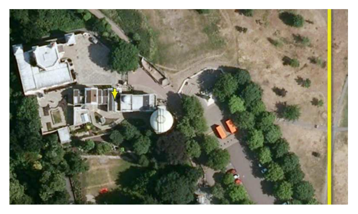
Figure 1. Greenwich Transit Circle Room v. the IERS Reference Meridian.

"Greenwich mean time is ambiguous" has also been debated within the UK Parliament's House of Lords. <sup>37</sup> However, these concerns may be assuaged as one considers the different levels of legality that may address such.